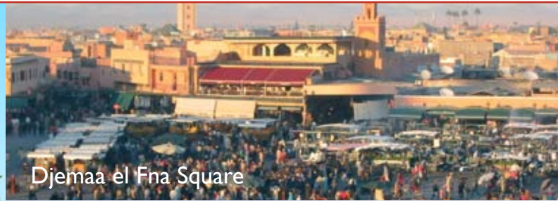
Djemaa el Fna Square